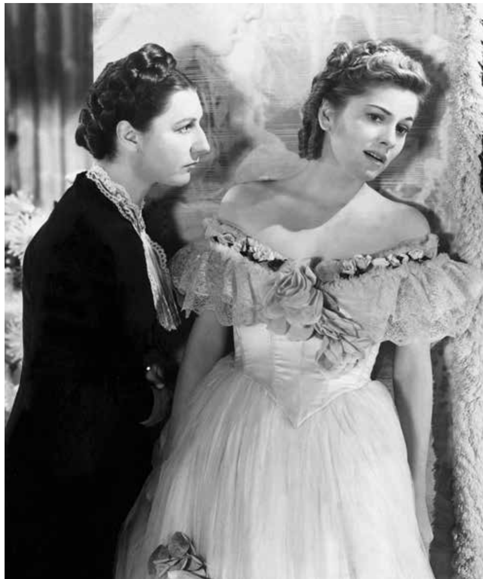
For Mrs Danvers, the second Mrs de Winter is but a pale imitation of her beloved Rebecca

father was the actor Sir Gerald du Maurier, her grandfather, George, the Punch illustrator and author of Trilby , identified with the second wife. Meek and overawed, the second Mrs de Winter bewails her gauche-ness, her lank hair and her bitten nails, in comparison with Rebecca, whose very name, 'written in a bold, slanting hand', was 'a symbol of herself, assured and confident'.